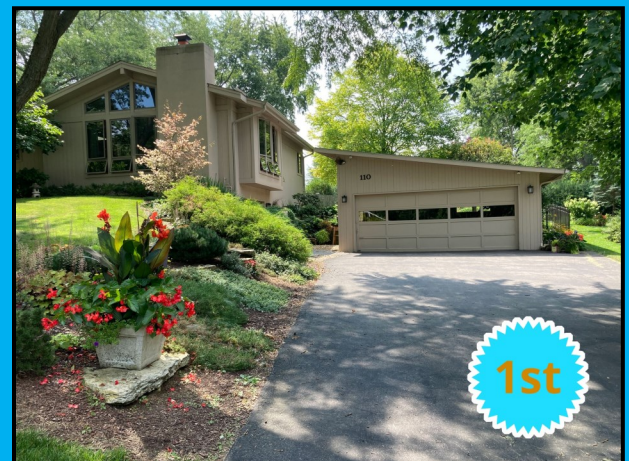
2023 Green Thumb Winner: 110 Long Avenue

The deadline to submit a property for Green Thumb is Thursday, June 20 and Committee members will be judging from June 21—June 30. Please make sure the house number is easily visible for judging!