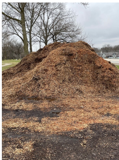
Free mulch available!

FREE Mulch is available at 314 Butterfield Road. Mulch is available to residents on a first come first serve basis. Please note, all mulch will need to be picked up and loaded by the resident; delivery of mulch is not available.