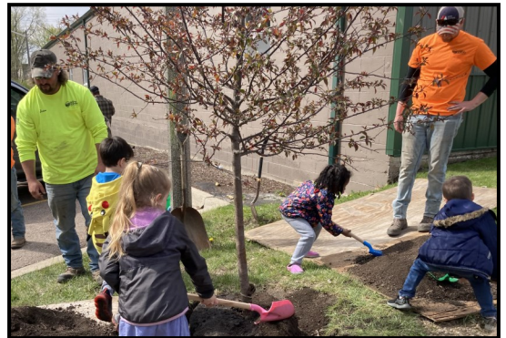
Arbor Day 2023 in the Village! Planting a tree on Marvo!

Arbor Day - Celebrate Arbor Day on April 26, 2024 by planting a tree! Trees provide shade, give off oxygen, reduce noise pollution, provide food and shelter for wildlife, and provide everyday products like paper, syrup, firewood, and building materials.