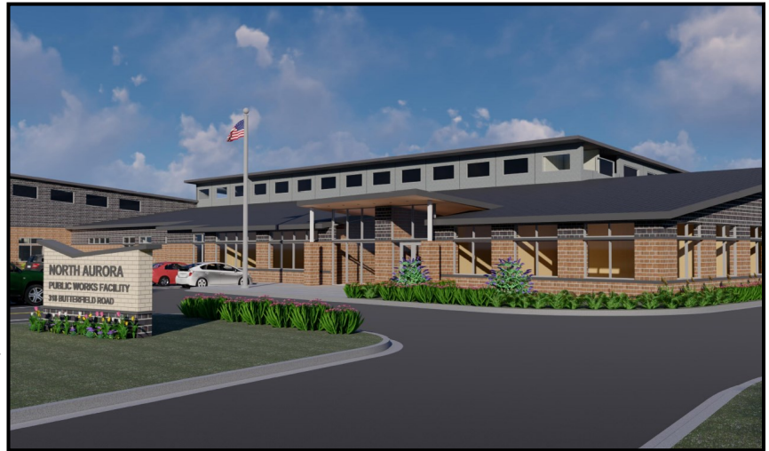
A design of the new Public Works Facility.

The new Public Works facility will provide much needed space for Village operations as well as include additional features like a training room and a new salt dome that Public Works employees will be able to utilize. The new Public Works facility is expected to cost in the area of $18 million for the building's construction. One of the ways the Village is looking to fund the project is through a Sales Tax referendum that will go towards not just the Public Works facility but other capital improvement projects around the Village. We will be hosting several Open Houses at the current Public Works facility so the community can see how our current operations are set up and why a new facility is being explored. See you there!