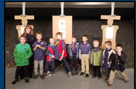
Checking out the gun range!