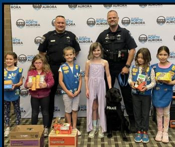
Meeting Pawfficer Zelda!