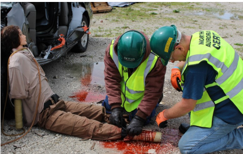
CERT volunteers applying a tourniquet to a training mannequin to stop severe bleeding.