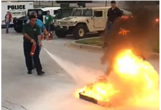
CERT students practice using a fire extinguisher to put out a small fire under the watchful eye of a firefighter.

The course meets on Tuesday evenings, September 6th to October 25th, 2022 from 6:30-9:30pm at the police station, 200 S. Lincolnway. Don't worry if you can't make a session or two or if you'll arrive a little late.