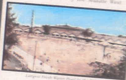
Largest Fresh Water Pool in the World

The Ideal Amusement Park in the heart of the