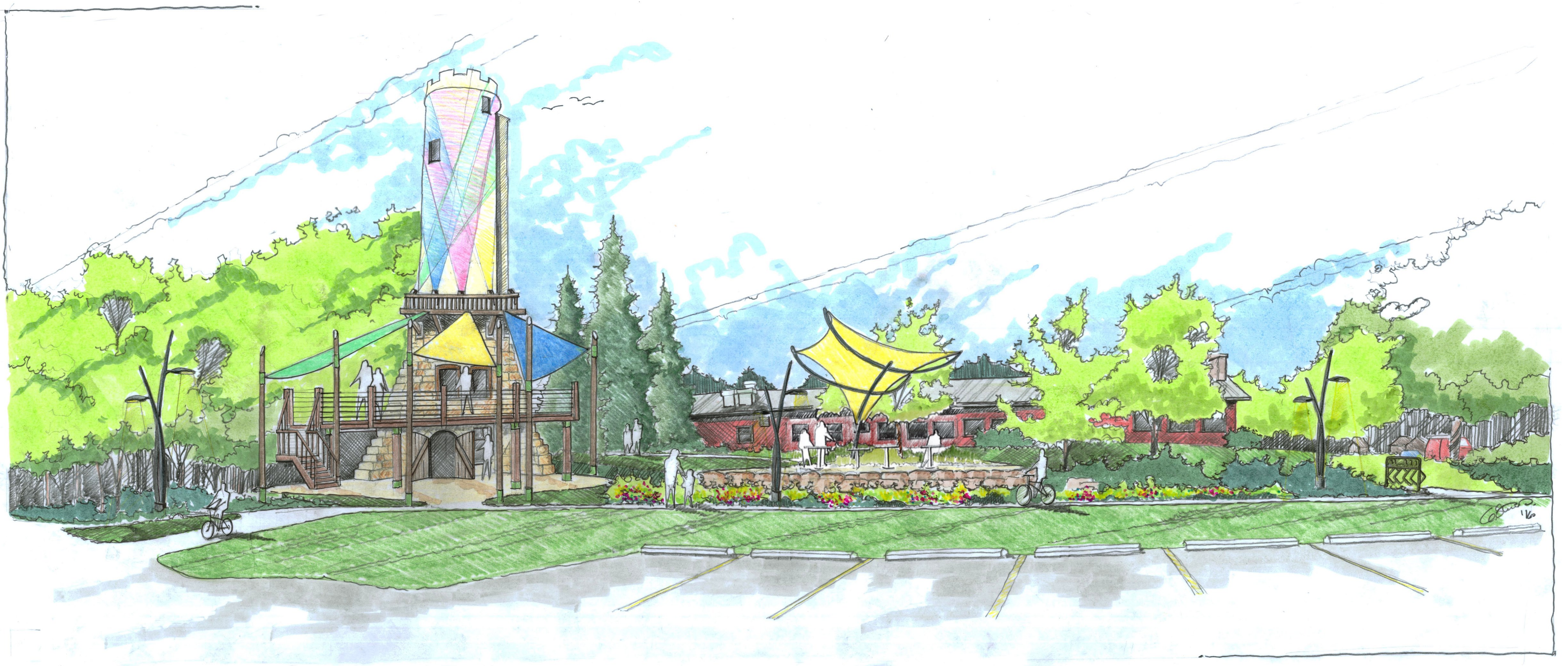
Silo Site - Looking West