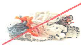
NO Plastic Bags & Film (Find a recycling site at plasticfilmrecycling.org )