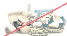
NO Foam Cups & Containers (Check Earth911.org for options.)