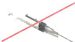
NO Needles (Keep medical waste out of recycling. Place in safe disposal containers like Waste Management's MedWaste Tracker® box.)

To Learn More Visit: RecycleOftenRecycleRight.com