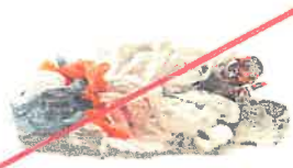
NO Plastic Bags & Film (Find a recycling site at plasticfilmrecycling.org )