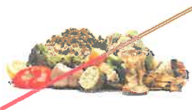
NO Food Waste (Compost instead!)