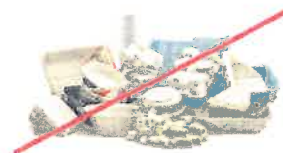
NO Foam Cups & Containers (Check Earth911.org for options.)