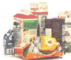
Food & Beverage Cartons