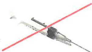
NO Needles (Keep medical waste out of recycling. Place in safe disposal containers like Waste Management's MedWaste Tracker® box.)

To Learn More Visit: RecycleOftenRecycleRight.com