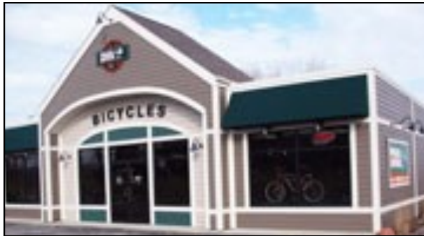
Pedal & Spoke Ltd. - 157 S. Lincolnway Awarded $21,000 in 2012 for façade improvements

In an effort to maximize the program's potential, the Village offers a continual application process that allows eligible participants to apply whenever funding is needed to assist with eligible projects. The amount of funding available for specific projects will depend on the amount of applicants and amount of funds made available during the specific fiscal year.