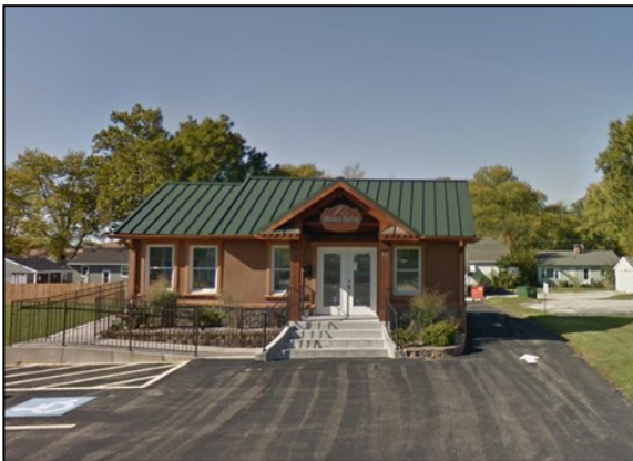
Midwest Roofing - 18 S. Lincolnway Awarded $13,200 in 2015 for façade improvements