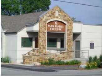
Previous Grant Project - 9 S. Lincolnway

The Village of North Aurora has maintained a robust Route 31 TIF Facade Grant Program since 2004. Due to the attractiveness of the program,